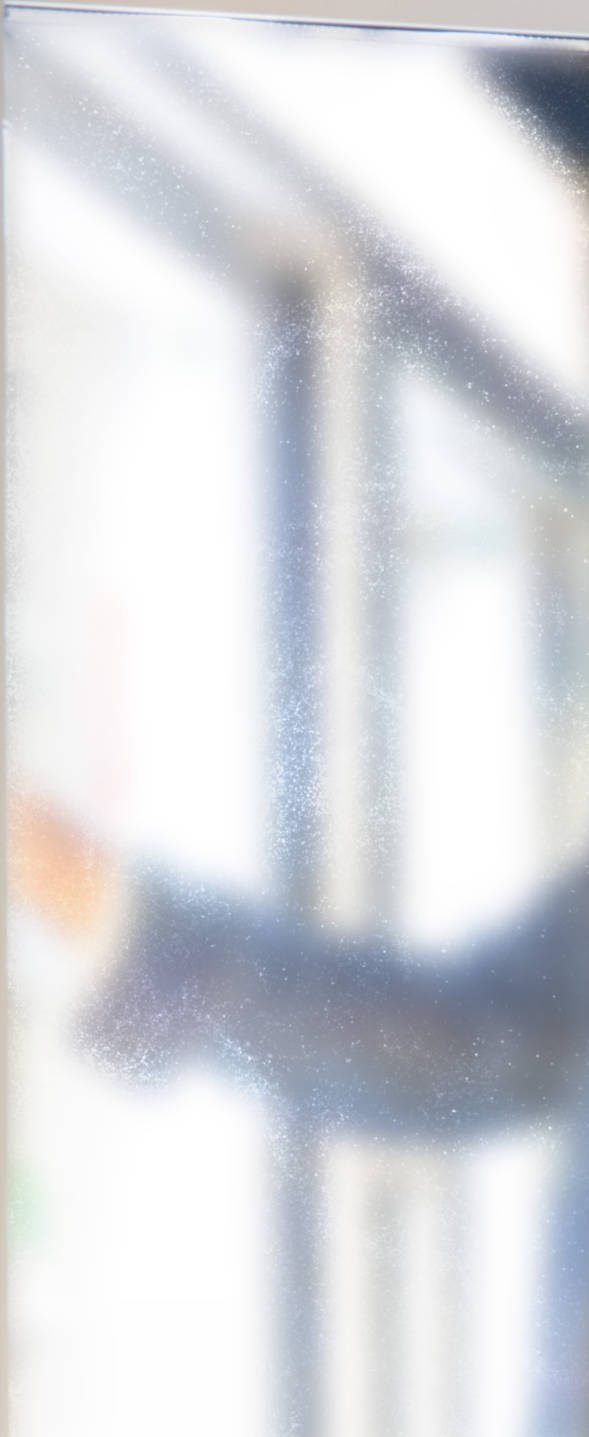
without anti-fog coating